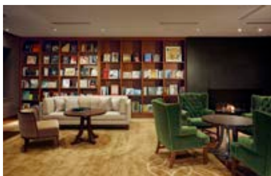
1F Library Lounge

We offer library corners throughout the hotel, curated by Ginza Tsutaya Bookstore, featuring a wide range of 1,500 books from Japanese culture to architecture, photography, and art. Enjoy serendipitous encounters and your time spent with us.