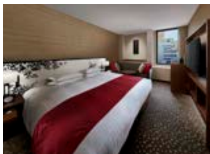
Standard King Room

We renovated our entire hotel from 2020 to 2023. With this renewal, the hotel has taken the opportunity to become a library hotel with a book collection centered on the city's culture, people, and history. History and culture are spun through the ages, leading to a better and richer tomorrow. This is the kind of hotel we are aiming for.