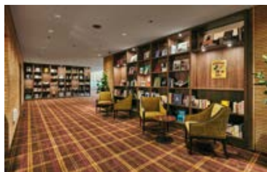
2F Foyer -Book & Culture