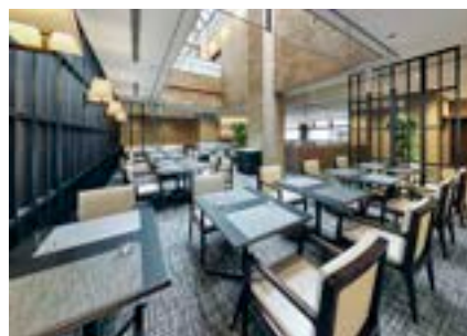
The Dining, a new restaurant