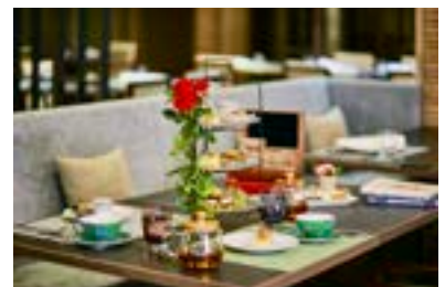
Blissful afternoon tea

At The Dining, we have offer “Blissful afternoon tea.” You are always welcome to enjoy our 1,500 books. Please enjoy a blissful time with your favorite black tea flavor, along with a book you like in hand, and sweets delivered from three types of restaurants that includes Japanese, Chinese, and Western cuisine. We are happy to accept reservations from one person.