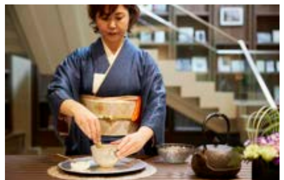
Table-Style Tea Ceremony - Experience Modern Culture In our lobby, surrounded by approximately 1,500 books and traditional crafts, you can enjoy a modern table-style tea ceremony performed by the Tsubaki-no-Kai. This special experience allows you to savor the elegance of the tea ceremony in a serene atmosphere.

Date: Every Thursdays at 10:00 a.m. – 10:45 a.m.